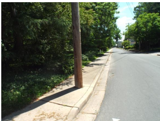
Obstacles such as telephone poles in the sidewalk may be problematic for users with physical disabilities.