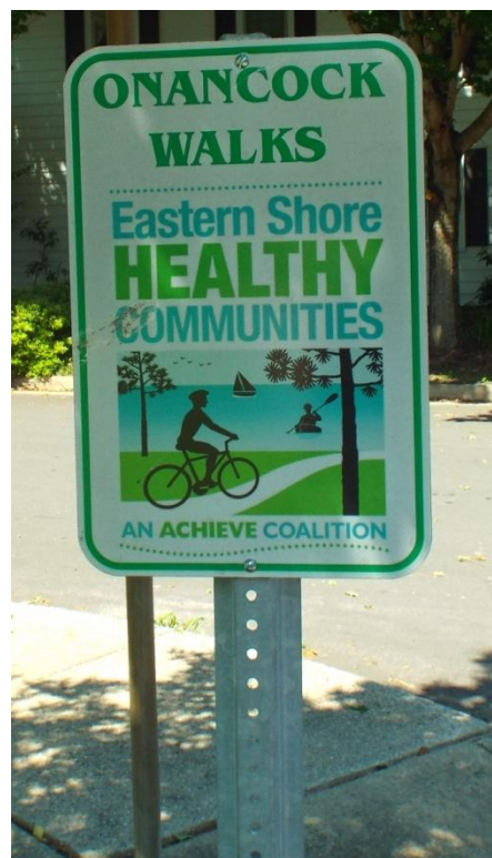
Enjoy your walk on the Onancock ESHC Walking Trail!

If you would like to add an observation or comment regarding this trail please e-mail e.fillebrown@gmail.com and include ESHC Onancock Trail in the subject line.